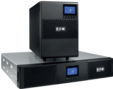
9SX Rack & Tower models